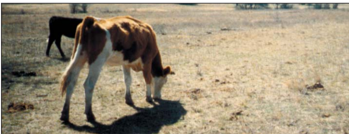
A pulled-down cow is at risk of contracting many types of diseases.

As a cow-calf herd goes into the fall season after a hot, dry summer, the entire herd may be stressed. Excessive heat, short grass and low water tanks stress cattle and make them more susceptible to diseases. Unsanitary conditions and abrupt diet changes also can lead to illness, as can other circumstances of stress. At the end of the summer, the cows are likely pulled down to a thin body condition from nursing the calves, the bulls worn out from breeding, and the calves shocked from weaning.