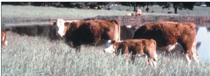
Hungry cows moved from dry to green grazing are susceptible to plant poisoning.

Fog fever is a respiratory distress syndrome that may occur in adult cattle 5 to 10 days after a change from dry, sparse grazing to a relatively lush, green pasture. Problem pastures have grass and weed regrowth after rains or irrigation and provide an excess of tryptophan amino acid, which in cattle is converted to a toxic compound. The toxin produced from the tryptophan causes lung edema (an accumulation of fluids) and emphysema.