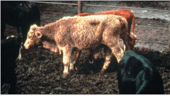
Calves with pneumonia and gastroenteritis are common in fall after a long, hot summer.

When any one of these health problems is recognized in a stressed cow-calf herd, it can be assumed the cattle were carriers that broke with the disease even without a recent exposure to the disease agent. The diseased cattle may have been exposed and become infected several months before the time of stress precipitating the disease in the cattle with clinical symptoms.