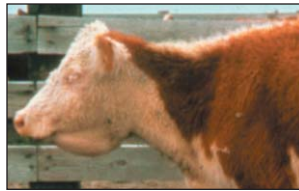
A cow with bottle-jaw.

Some cattle may become emaciated with “bottle-jaw” (a soft swelling under the jaw) and advance to a “downer” stage, becoming unable to rise. In many cases, the cattle may die.