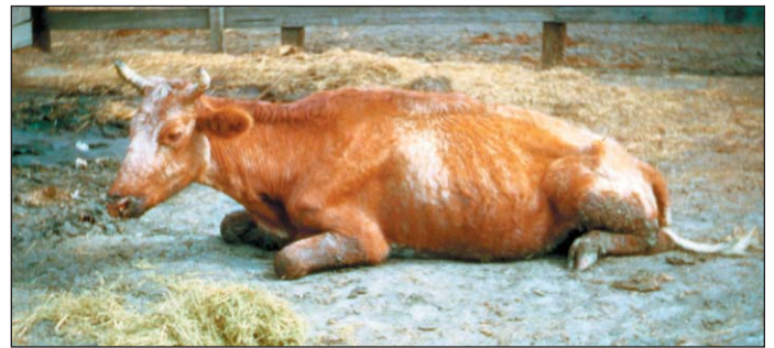
In many cases, cows that advance to the “downer” stage may die.

Many animals go down and cannot rise after 3 to 7 days of clinical signs of acorn poisoning. If these affected animals do not die, it may take as long as 2 to 3 weeks before they start to recover. Producers suspecting such a problem should contact a veterinarian as soon as possible.