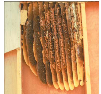
Bees can construct large wax nests rapidly once they enter a home. For this reason, both bees and nests should be removed as soon as possible.

easy to distinguish bees from wasps. Bees are generally hairy, with stout bodies and wide, flattened hind legs for carrying pollen ( see figure ). Wasps are generally smooth or have scattered hairs; they also have distinct “waists.” Another way to tell the two types of insects apart is to find the nest or hive. Honey bee colonies build a wax comb in which to rear their young and store food. Social wasps form nests of paper-like material.